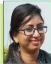
Chahat Teacher Learning center