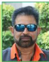
Chetan Sharma Legendary Cricketer